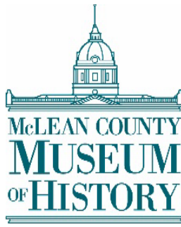
Exhibit Sponsorship Opportunities